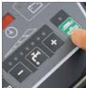
Operating panel: All cleaning functions can be started simultaneously. Quick and easy.