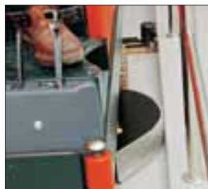
Working close to the edge: Poses no problem with protruding brushes and suspended squeegee.