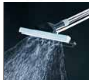
Tool: Scrubbing and vacuuming tool available as an accessory for the cleaning of edges and corners.