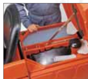
Tank: Large flexible wall tank, 140 litres. Outlet hoses with dosage device for quick emptying.