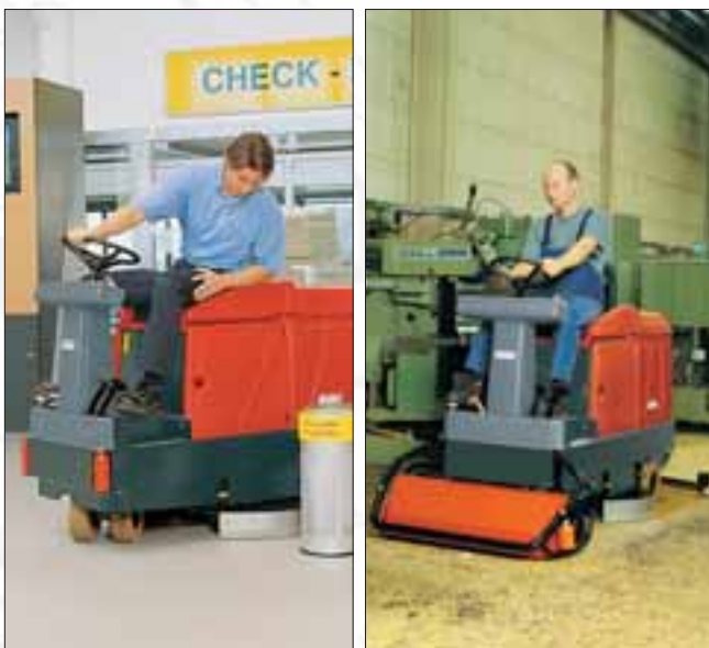
Hakomatic B 910: For perfect maintenance or basic cleaning. Highly manoeuvrable, compact, easy, light handling, powerful and efficient.