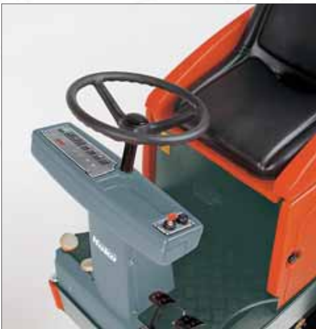
Cockpit: The operator can access the cockpit from both sides with an excellent view of the area to be cleaned. All operating elements are in direct view and easy reach of the operator. Adjustable, comfortable driver's seat.