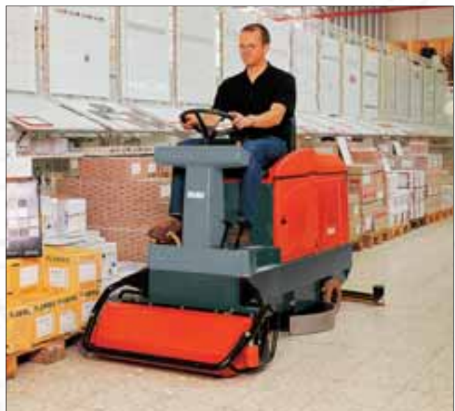
With pre-sweep and tool: Pre-sweeping and scrubbing in one operation, additional scrubbing and vacuuming tool for edges and corners.