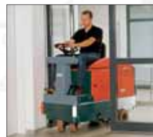
Compact and manoeuvrable: Fits for e.g. through any standard door. Minimum passing width of 70 cm.