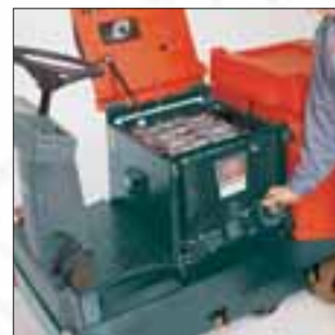
Batteries: Battery system easy to access with quick exchange device (optional equipment).