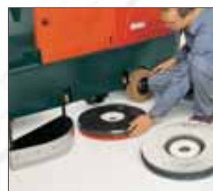
Brushes: Brushes and pads can be changed in a flash without the use of tools.