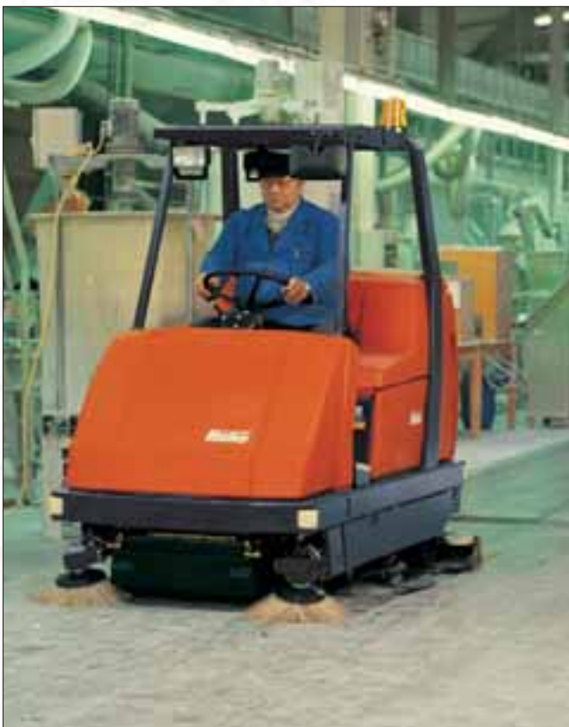
With pre-sweep: even larger debris is kept under control "from the word go". Industrial cleaning really can be this quick and safe.