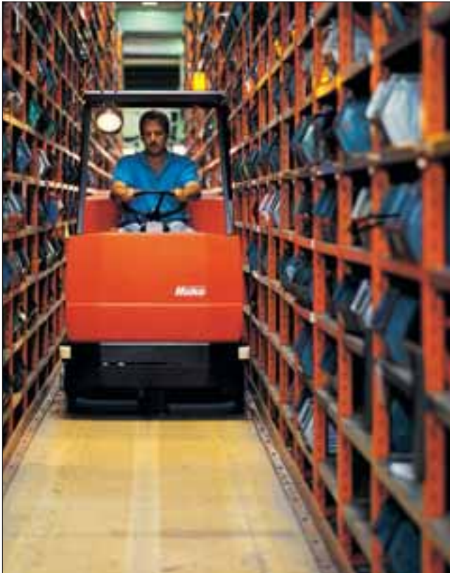
Without pre-sweep: wet scrubbing and dry vacuuming, without problem even in narrow passageways/aisles.