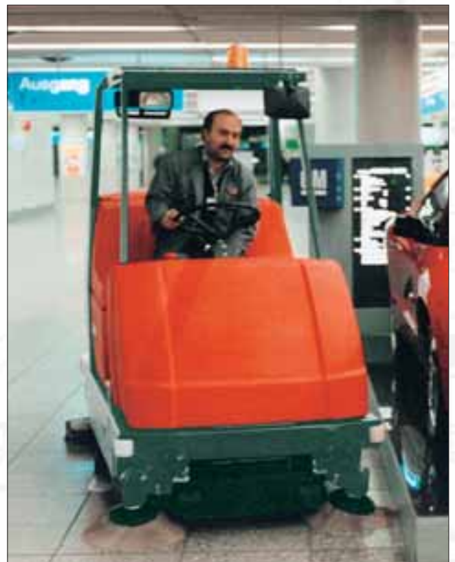
With pre-sweep: complete cleanliness right up to the edge, even in airport terminals. Inviting, attractive, appealing and presentable.