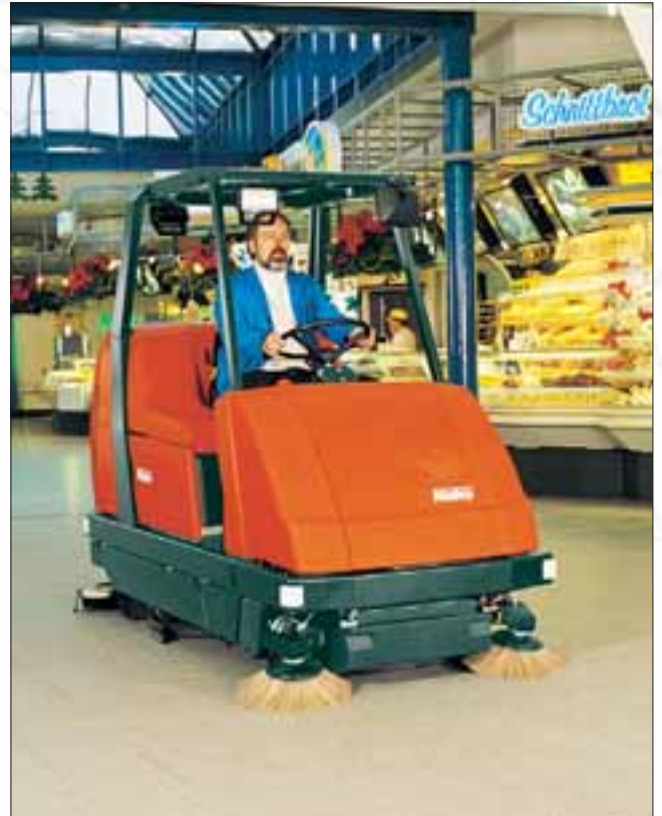
With pre-sweep: sweeping, wet scrubbing and dry vacuuming in only one operation.