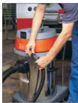
Handy drainage hose for easy emptying of liquids.