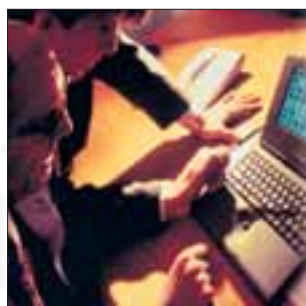
Sales, hire, leasing, rental Hako allows you to individually plan capital investments depending upon customer's demands and the available means.