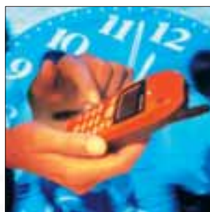
We are there for you day and night Reliable after-sales service and excellent logistics guarantee that machines can be ready for operation around the clock.