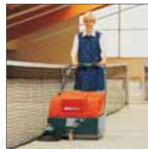
Vacuum sweepers for thorough cleaning of special floor coverings in sports halls.