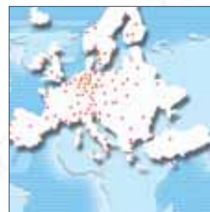
Hako is never far away The efficient Hako sales and service network mean that Hako is always close at hand.