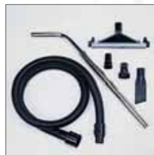
Equipped as standard with numerous accessories for wet and dry cleaning. The vacuum hose is particularly large.

The cooled by-pass motors and indestructible tank made of chrome steel guarantee a long machine life.