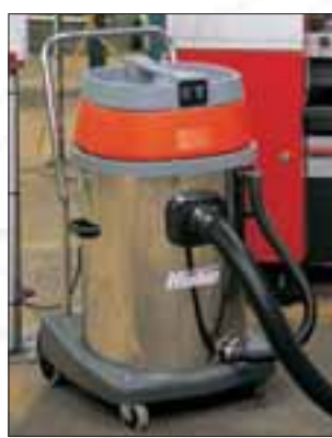
Further advantages: Sturdy connections between suction head and tank, robust chassis with stable handle.