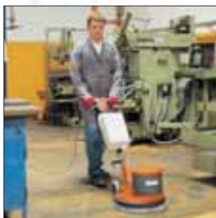
Single disc machines for cleaning hard floors and carpets.