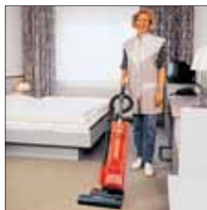
Brush vacuum for cleaning various types of carpet pile.