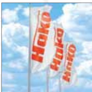
Cleanliness with safety Hako machines adhere to strict quality regulations/standards. Quality made by hako. We also take care of what we sell – World-wide.