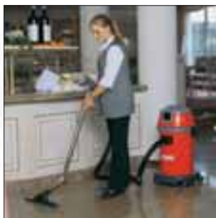
Hako-Supervac 290 with floor nozzle for daily maintenance cleaning. Robust, quiet, professional.

Further advantages: Four wheel chassis with steering castor wheels for easy manoeuvrability, impact-resistant synthetic material container, noise-reduced cooled vacuum motors.