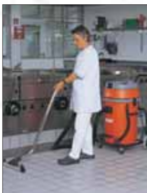
Hako-Supervac 550. Swallows everything in sight. Seen here being used as a wet vacuum in kitchen areas.