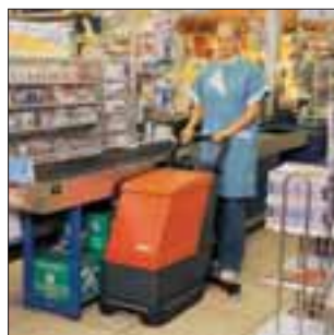
Automatic scrubber-driers for intensive wet cleaning of hard floors.