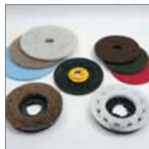
Extensive: A wide variety of brushes, pads and drive plates available for all kinds of use.