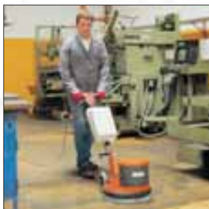
Hako-Super 43/180 Standard machine for basic and maintenance cleaning. Typical field of use: shampooing carpeted areas and basic cleaning of all types of hard floors.