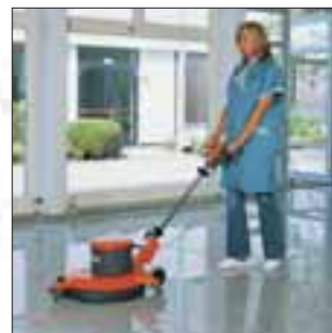
Hako-Super 53/1100 High-speed machine for polishing, cleaning and spraying. Higher productivity by Powerflow system. Typical field of use: polishing all modern types of hard floors.