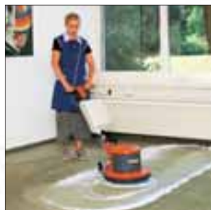
Hako-Super 43/2-speed Universal single-disc machine for scrubbing and polishing, 2 speeds adjustable. Typical field of use: scrubbing and polishing with one single machine.