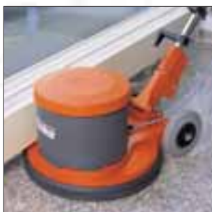
The flat and protruding brush head allows access even below radiators etc.