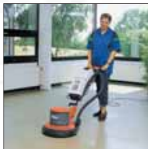
Hako-Super 43/450 High-speed machine for high mirror polishing and cleaning. Construction as Hako-Super 43/180. Typical field of use: polishing of soft floors.