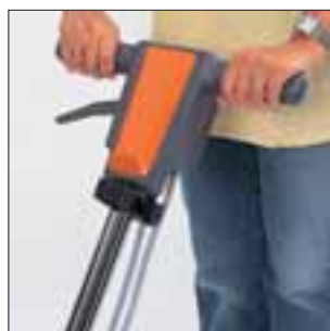
Ergonomic: continuous adjustment of draw- or handlebar allows perfect height adjustment.