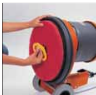
Serial equipment: pad holder with "Centerlock" for quick pad replacement without tools